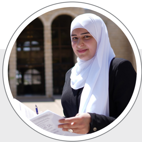
Majdal Ladadweh Accounting