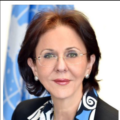
Dr. Rima Khalaf-Hunaidi