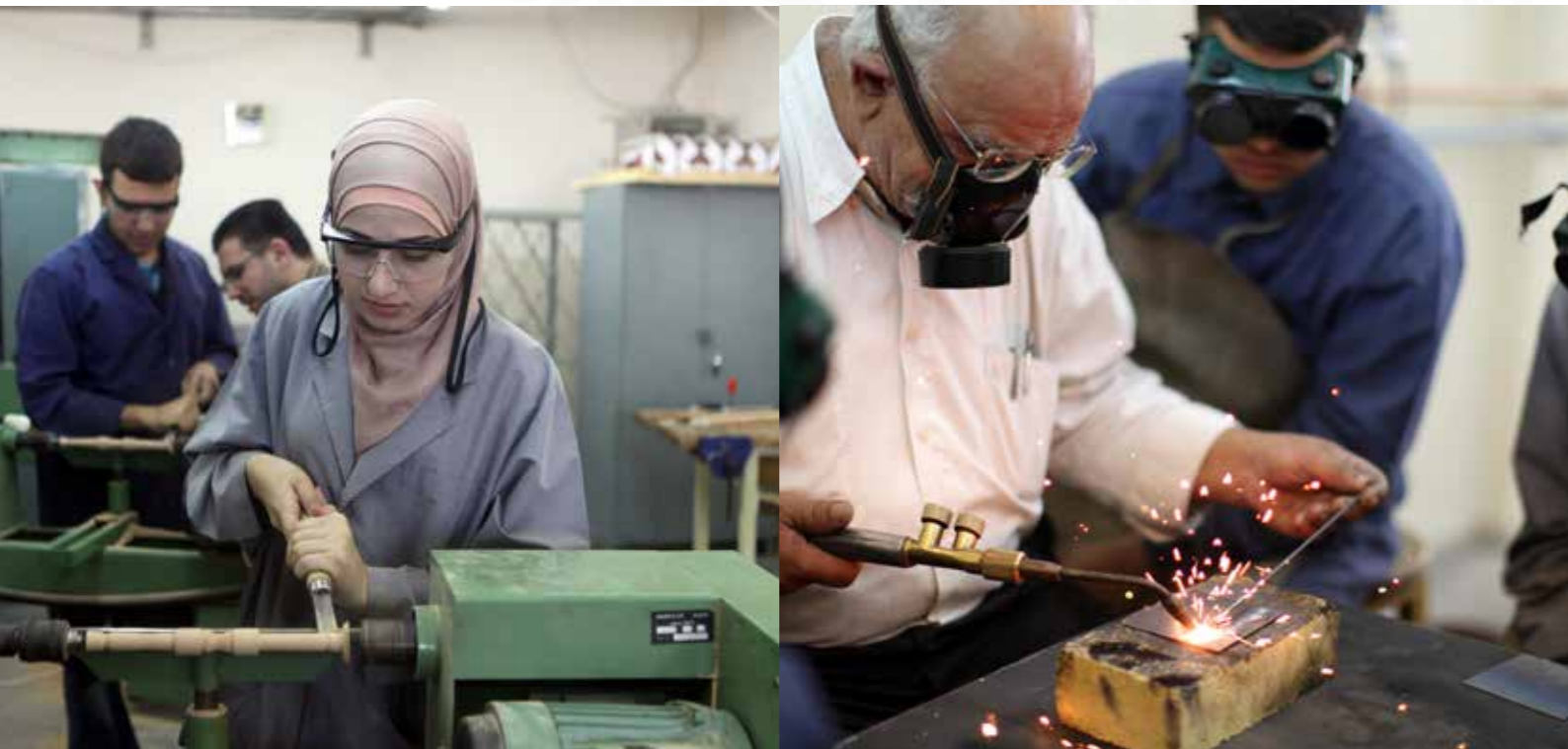
Engineering Faculty workshops